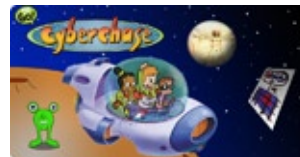
CYBERCHASE Volume 1 - Issue 4 Grades 3-5