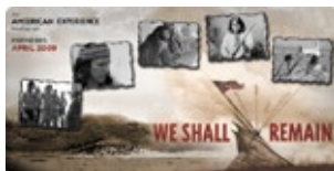
We Shall Remain Volume 2 - Issue 2 Grades 6-12