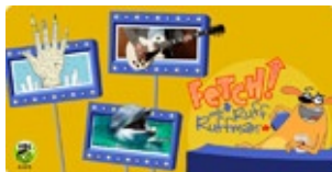
Fetch! Volume 1 - Issue 3 Grades 1-5