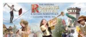
Renaissance Festival Volume 2 - Issue 5 Grades 5-12