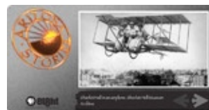
Arizona Stories Volume 2 - Issue 1 Grades 4-8