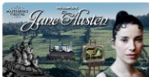
Jane Austen Volume 1 - Issue 1 Grades 9-12

Specific PBS programs highlighted to connect to Arizona Academic & Early Learning Standards, specific grades and subjects, and other resources you have access to as an Arizona educator.