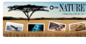
PBS Nature Volume 2 - Issue 3 Grades 3-12