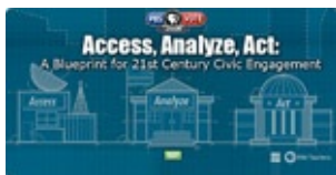
Access, Analyze, Act: Volume 1 - Issue 5 Grades 7-12