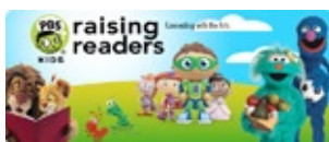
Raising Readers Volume 2 - Issue 4 Grades PreK-3